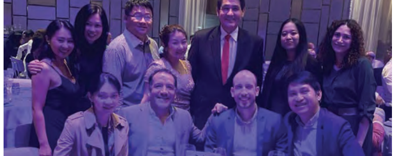
2021 TOURISM TRAINING AUSTRALIA TRAINER OF THE YEAR