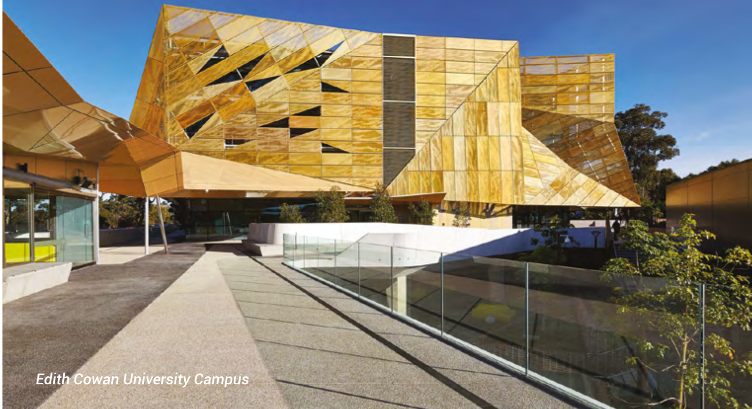
Edith Cowan University Campus

© 2023 The material, information, design, text, graphics and layout contained within the IIBT prospectus are owned or licensed to IIBT and protected by copyright under the laws of Australia and other countries. You must not otherwise reproduce, transmit (including broadcast), adapt, distribute, sell, modify, publish, communicate to the public or otherwise use any of the material in this prospectus, except as permitted by Federal copyright legislation or with IIBT'S prior written consent. IIBT endeavours to ensure all information contained in the prospectus was correct and current at the time it was last modified. IIBT monitors this prospectus regularly and changes and updates information when necessary. Users of the IIBT prospectus and the information contained within it are doing so based on individual discretion; IIBT will hold no responsibility for any damages or loss incurred by its use. IIBT reserves the right to change program offering, arrangements and all other aspects without notification at any time.